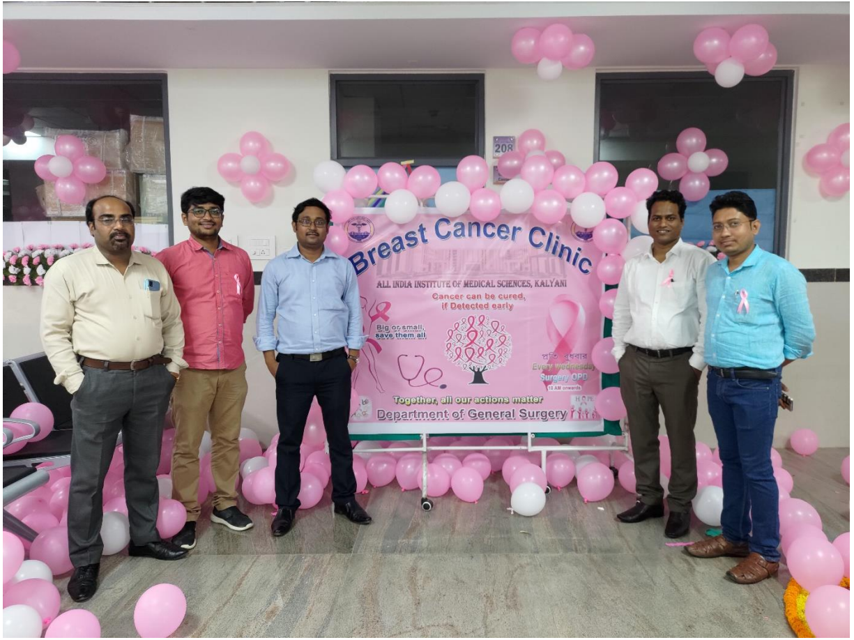
Team General Surgery