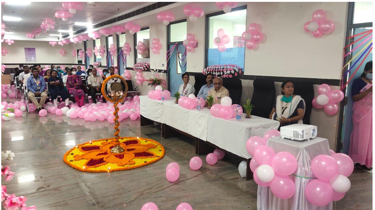
Inaugural Session of CME cum Clinical workshop on Breast Cancer.