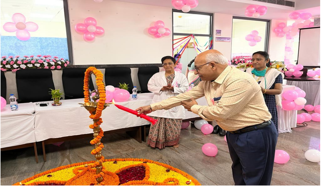
Inauguration of the program by the Executive Director, AIIMS Kalyani.