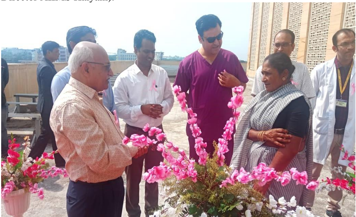
Interaction with the patients